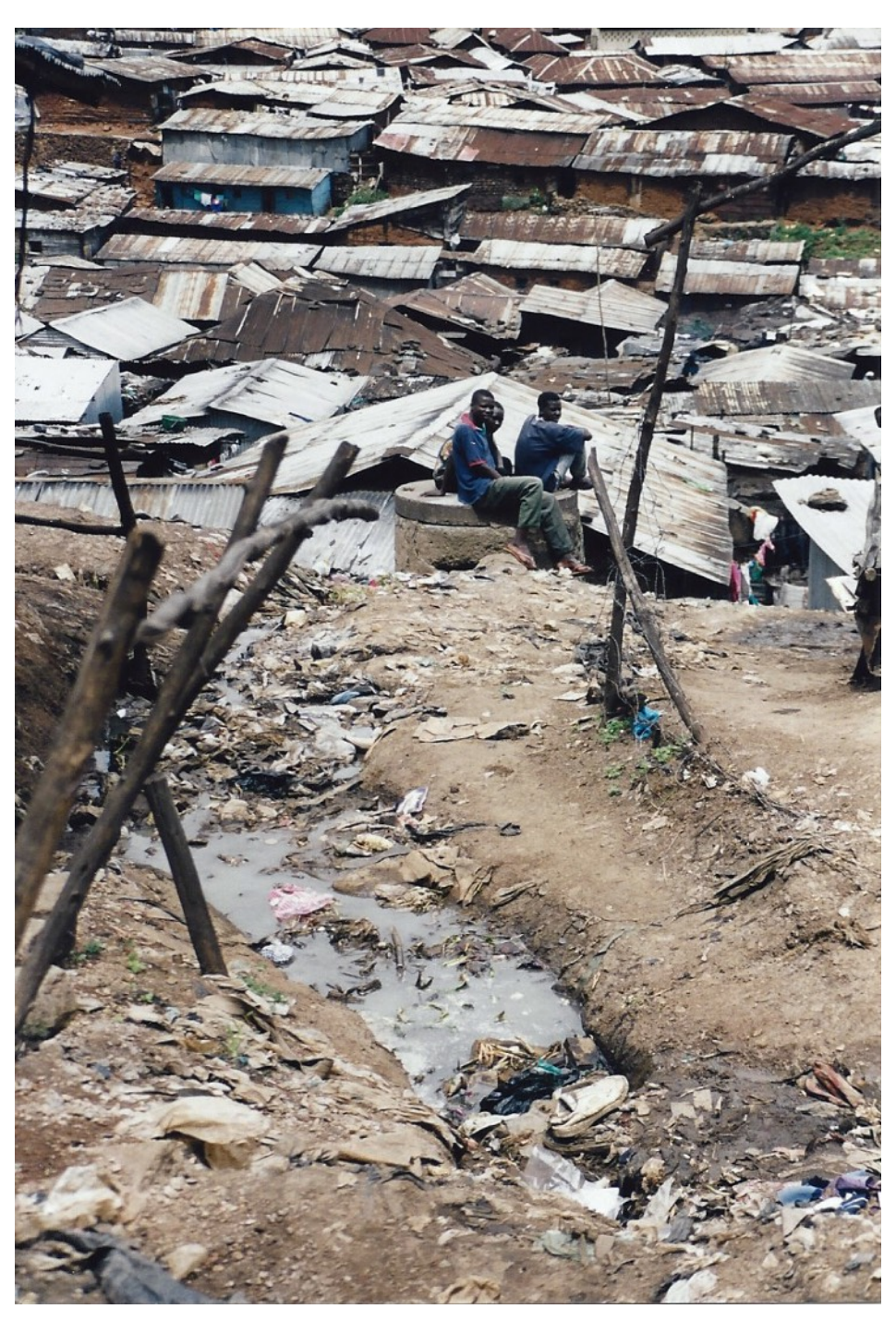
Kibera slum, Nairobi, Kenya, in 1998. It looks much the same today.